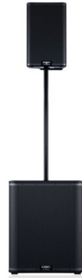
QSC Sub and Top

The system is scalable for smaller venues and powerful enough for outdoor events.