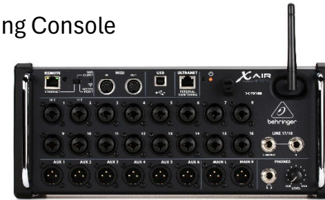
X-Air XR18 Mixer